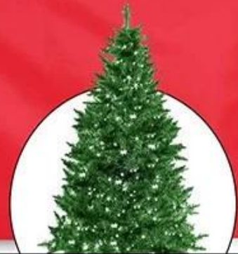
Fits up to 7.5" tree