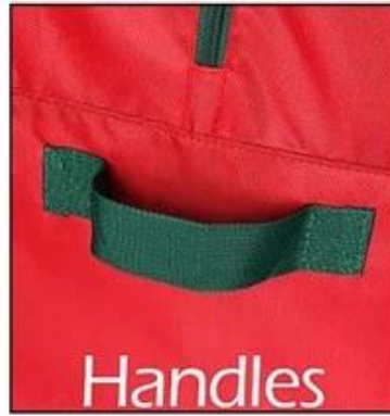
Handles For Easy Carrying