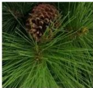
Pine needle tips