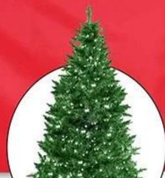
Fits up to 7.5" tree