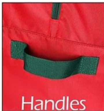
Handles For Easy Carrying