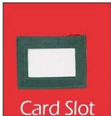
Card Slot To Name Contents