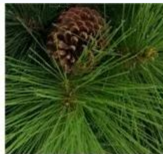
Pine needle tips