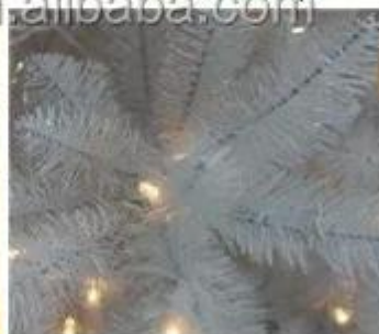
White tips (branches)