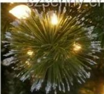
Glitter pine needle tips