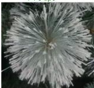
Flower needle tips