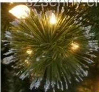
Glitter pine needle tips