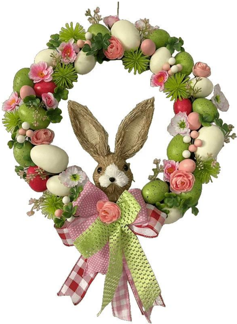
Easter Wreath with Rabbit Hanging Decoration Mixed Artificial Leaves