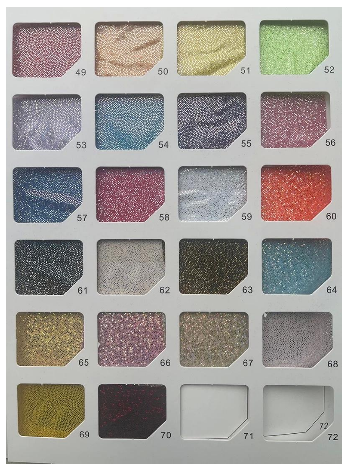
Whether you're seeking traditional decorations or want something unique and creative, Senmasine manufacturers offer an abundant selection. Let's embrace the joy and creativity