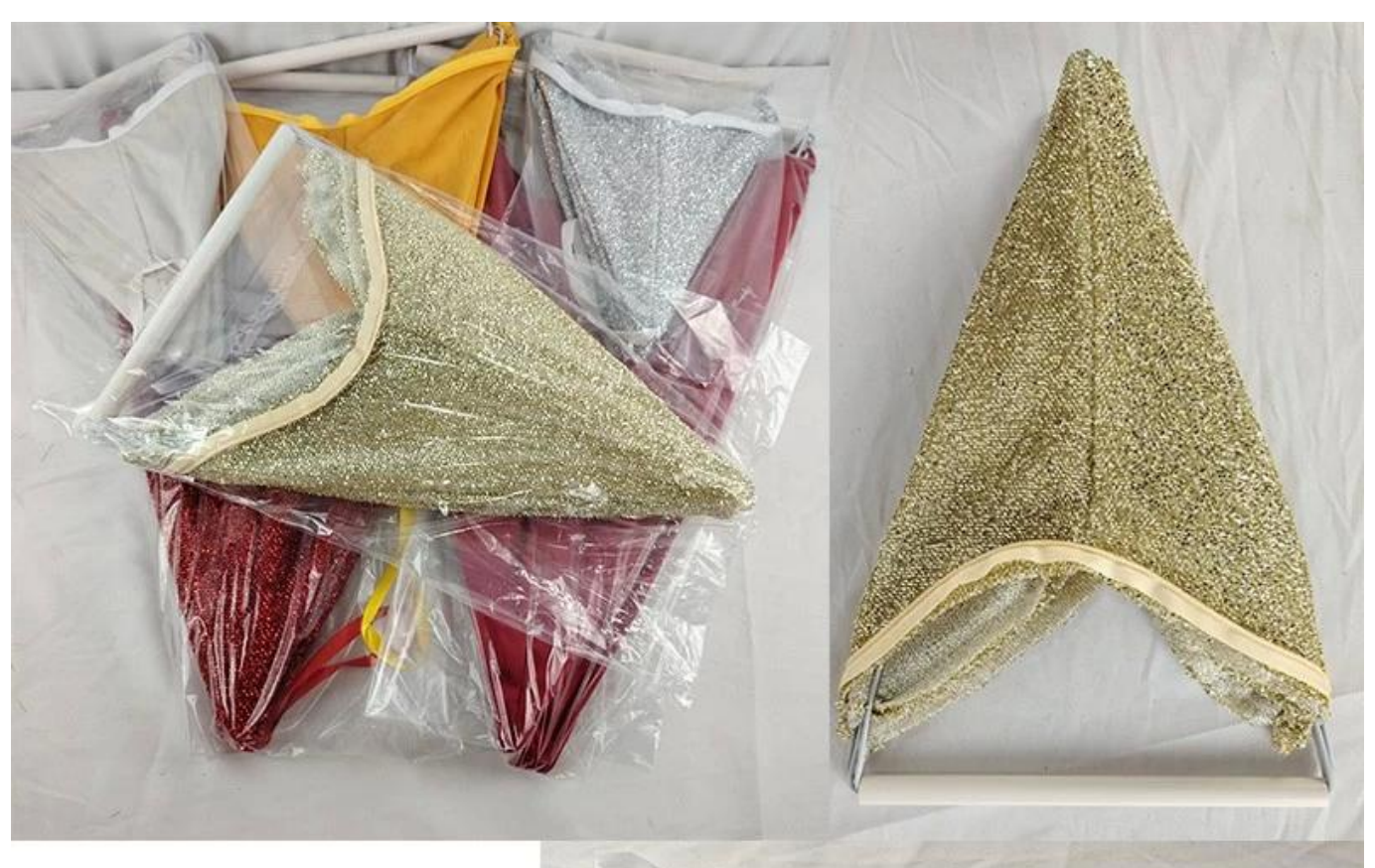
It is foldable Not occupying space