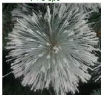
Flower needle tips