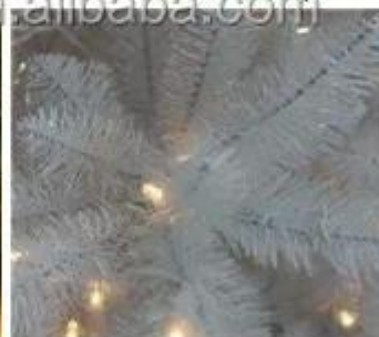
White tips (branches)